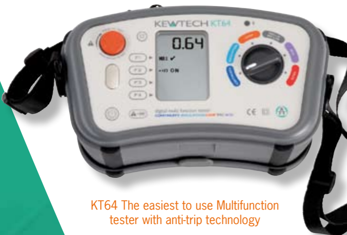
KT64 The easiest to use Multifunction tester with anti-trip technology